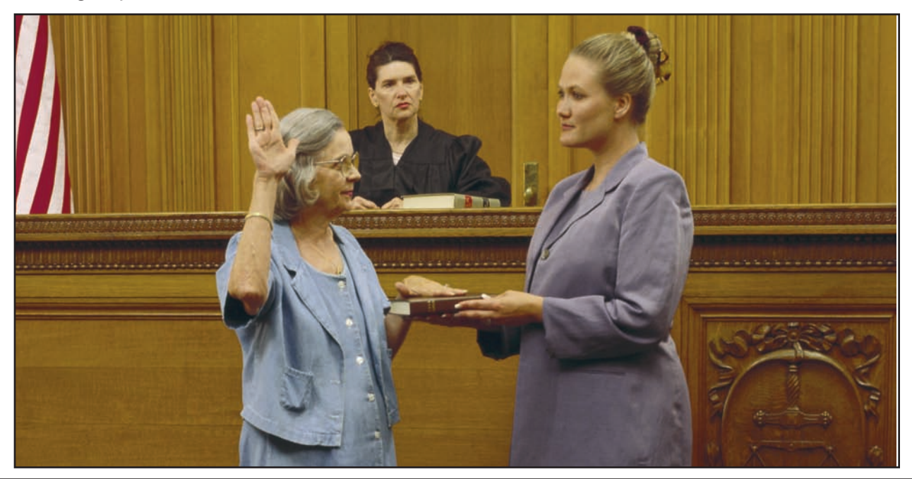
GUIDE TO CIVIL LAWSUITS

A civil suit cannot undo the harm a perpetrator caused. However, a survivor may choose to file a civil suit in order to get some money for the harm the perpetrator caused. A survivor may also file a suit to hold the perpetrator accountable for the sexual assault or to make the perpetrator, and others, think twice before committing another assault. It is important to know, however, that a civil lawsuit may take a lot of time and money and may open the emotional wounds you worked hard to heal. You should carefully weigh the possible pros and cons of filing a civil suit that are listed on the next page. Remember that a decision not to sue also can be an empowering experience.